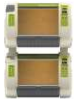
* Brooder standing image